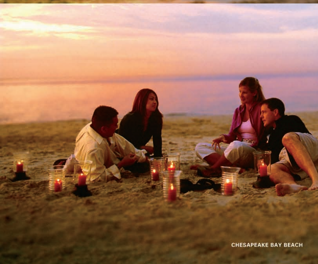
CHESAPEAKE BAY BEACH

Located 15 miles south of (and 180° opposite) the Resort Area, Sandbridge is a secluded beach hideaway of pristine sand dunes and dancing sea oats. Beachside, the Atlantic never fails to entertain. And for those craving even more of the great outdoors, the marshes and open waters of Back Bay National Wildlife Refuge and False Cape State Park make for great kayaking, hiking, and fishing. Cottage and condominium rentals are available year-round.